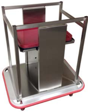
OTD Open Tray Dispenser

Email: technicalservice@carter-hoffmann.com