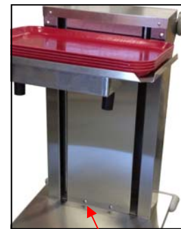
Cantilever dispenser—removed screws from access panel on front or back of upright