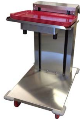
CTD Enclosed Tray Dispenser