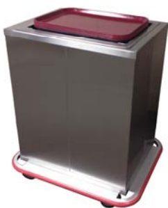
Enclosed cabinet—lift entire lowerator assembly out of cabinet to access the springs