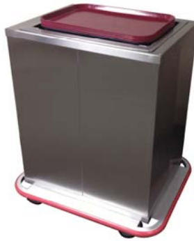
ETD Enclosed Tray Dispenser