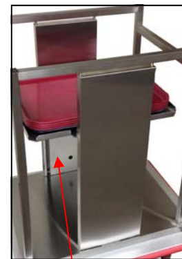
Open dispenser—access panels on inside of each upright

After adjustment, replace panels (cantilever and open tray racks) or re-insert the tray lowerator assembly back into the cabinet (enclosed tray racks)