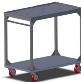
TT Insulated Tray Transport