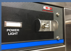
On/Off Switch with Protection Cover