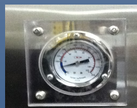
Lexan Thermometer Cover