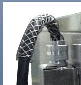
Metal Cord Strain Relief