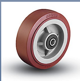
6" Polyurethane Casters