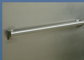
1" Tubular Stainless Steel Handles