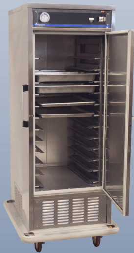
PHB480 Mobile Refrigerator