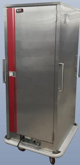
PH1830 Heated Transport Cart