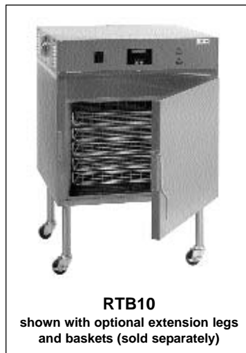
RTB10 shown with optional extension legs and baskets (sold separately)

EASY GRIP DOOR HANDLE WITH MAGNETIC CATCH... Ergonomically designed for easy opening. Keeps door positively closed for optimal cabinet performance.