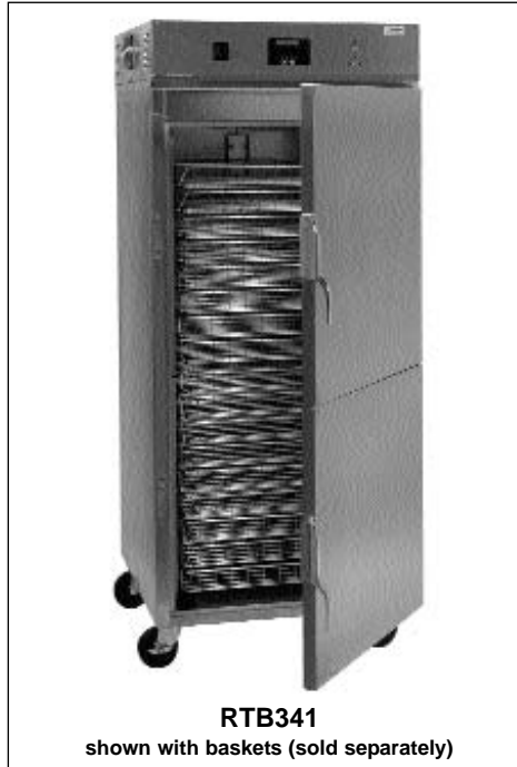
RTB341 shown with baskets (sold separately)

VERSATILE RETHERMALIZATION CAPABILITY... Rethermalizes a variety of pre-packed food items from chilled to serving temperature... most in an hour or less.