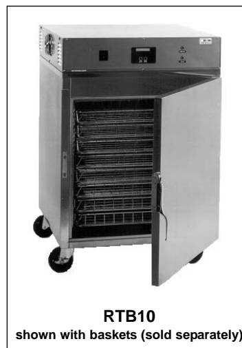
RTB10 shown with baskets (sold separately)