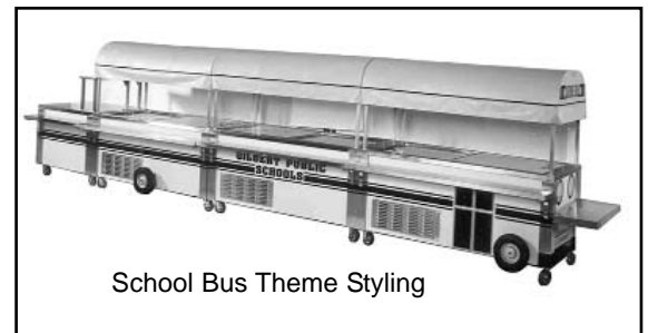
School Bus Theme Styling