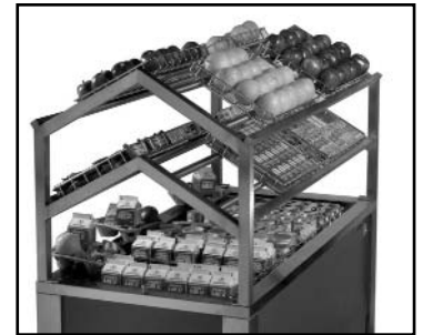
Double-tier Unheated Display Merchandiser

STAINLESS STEEL TRAY SHELF 18 gauge reinforced stainless steel, with drop-down brackets.