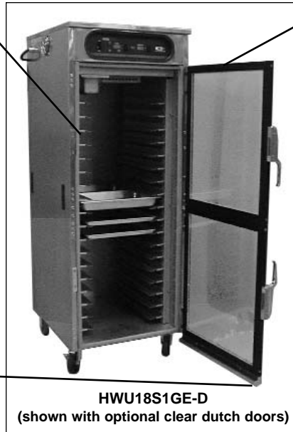
HWU18S1GE-D (shown with optional clear dutch doors)

STAINLESS STEEL DRIP TROUGH... Located at base of door to catch condensation. Easy to remove sliding keyhole design for emptying and cleaning.