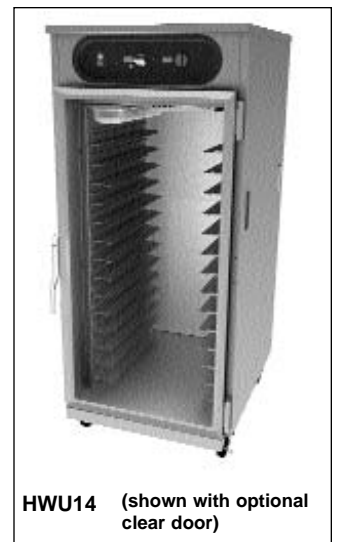
HWU14 (shown with optional clear door)