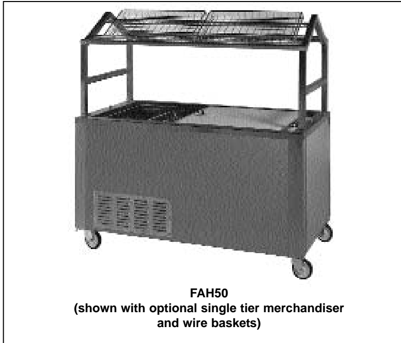
FAH50 (shown with optional single tier merchandiser and wire baskets)

Speeds up service and saves labor because kids serve themselves. Large capacity well reduces number of restocking trips.