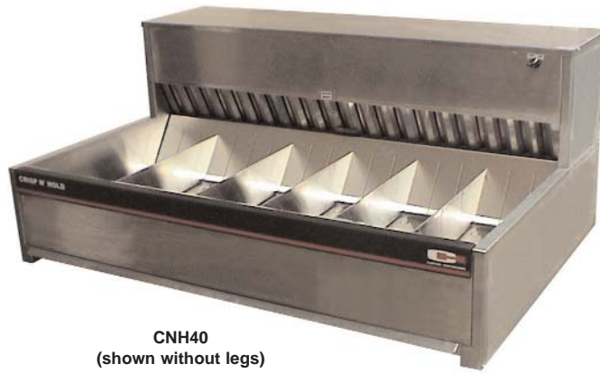
CNH40 (shown without legs)