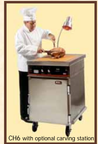
CH6 with optional carving station